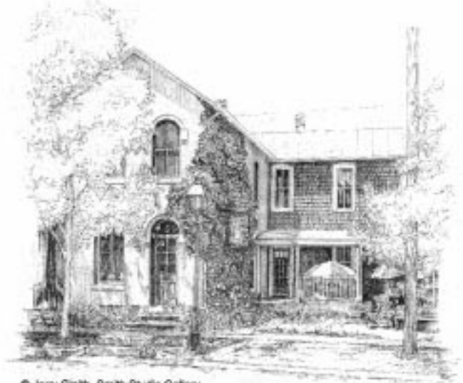
27 South High Street

The first bridge across the Scioto River at this site was a wooden bridge built ca. 1840. Prior to that time, travelers heading east had to ford the river just below the mill at the south end of Riverview Street. The road to Worthington then ran along what is today Martin Road. The wooden bridge was replaced by a steel bridge in 1880, which was itself replaced by a handsome concrete-arch bridge in 1935. In 1986, the arched bridge was topped with a wider, four-lane deck. The original arches may still be seen from Kiwanis Park at the foot of Dublin Spring Road (see No. 45).